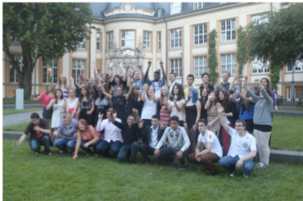
The Discovery Summer Camp 2012: 50 participants from all over Germany!